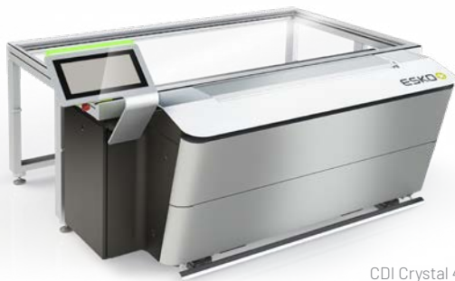
CDI Crystal 4835

They lay the groundwork for full integration and automation of plate imaging and UV exposure.