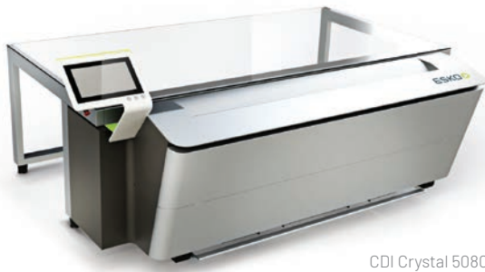
CDI Crystal 5080