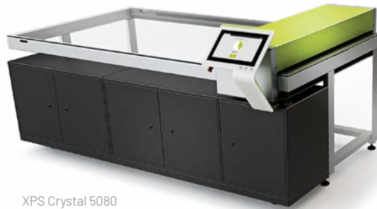
XPS Crystal 5080