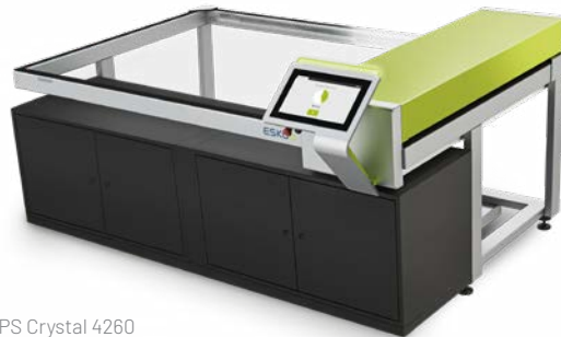
XPS Crystal 4260