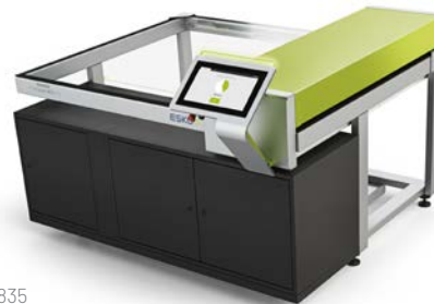
XPS Crystal 4835